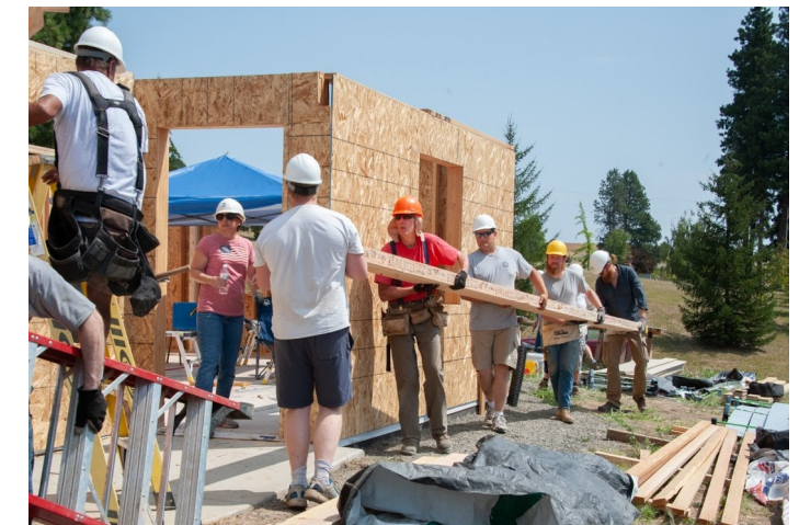
Thank you Plateau Archeological Investigations!