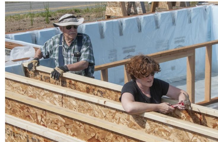
Thank you Latah County Board of REALTORS!