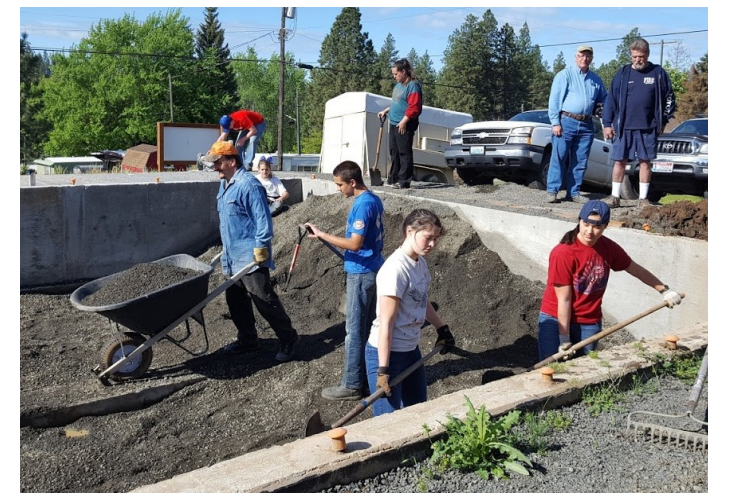
Thank you Scout Troop 358 and Venture Troop 380 (Potlatch) for your help!