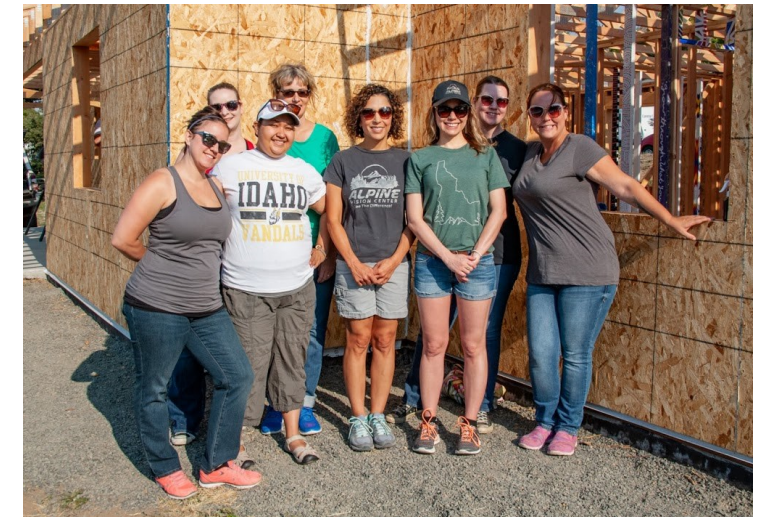
Thank you Alpine Vision for your help painting siding.