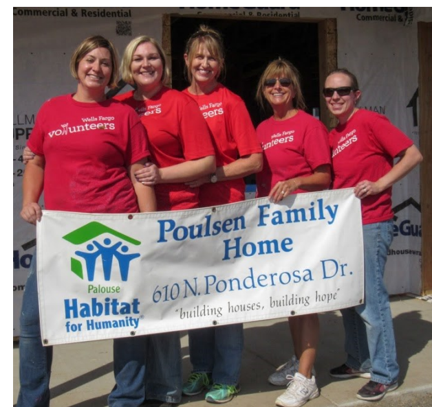
Thank you Wells Fargo.