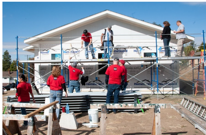
Codger Crew and Wells Fargo using scaffolding donated by Moscow Rotary, ready to install siding on east wall.