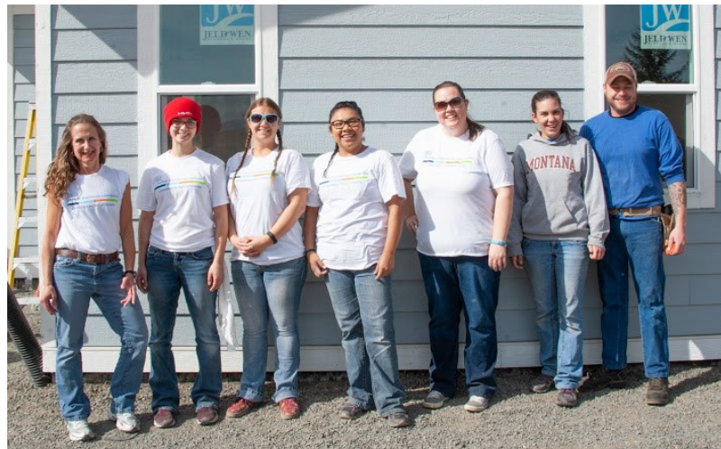
Thank you SEL Little Edisons Preschool.