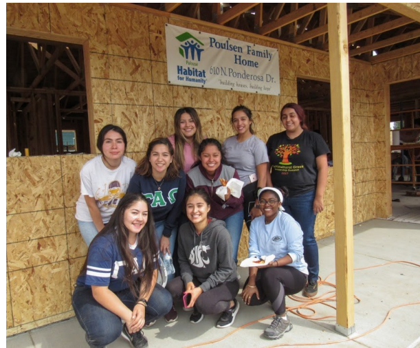
Thank you GAO—Delta Chapter, Washington State University