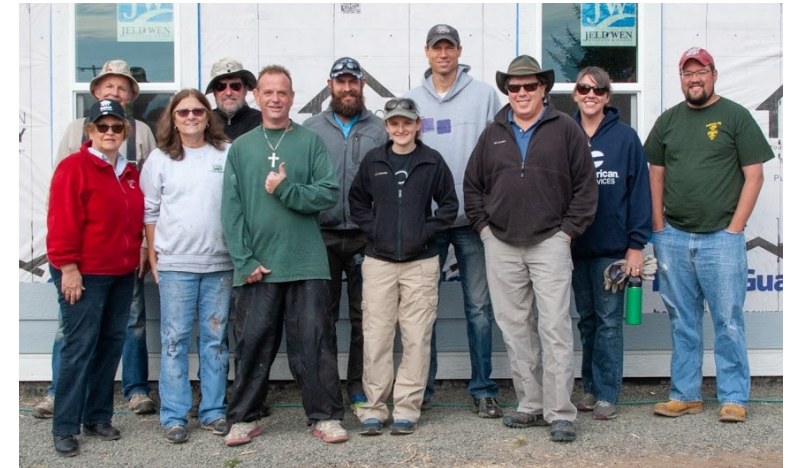
Thank you regional United Methodist Churches.