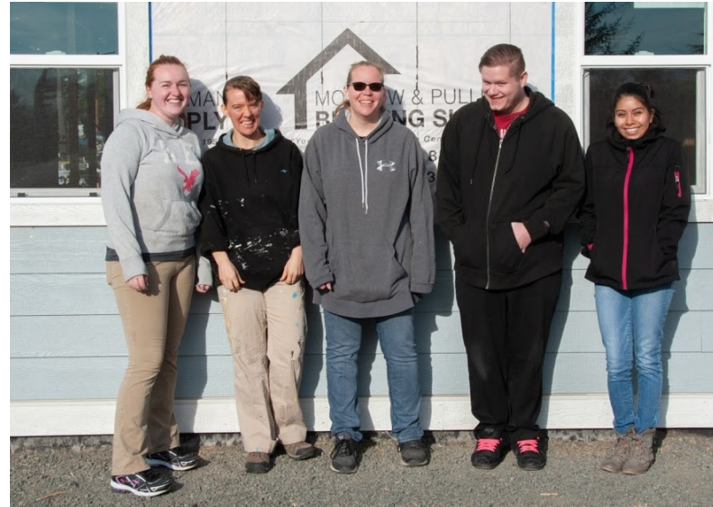
Thank you Fairfield Inn and Suites, Moscow.