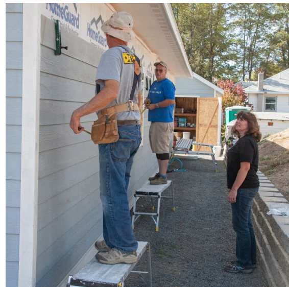
Codger Crew installing the last of the siding.