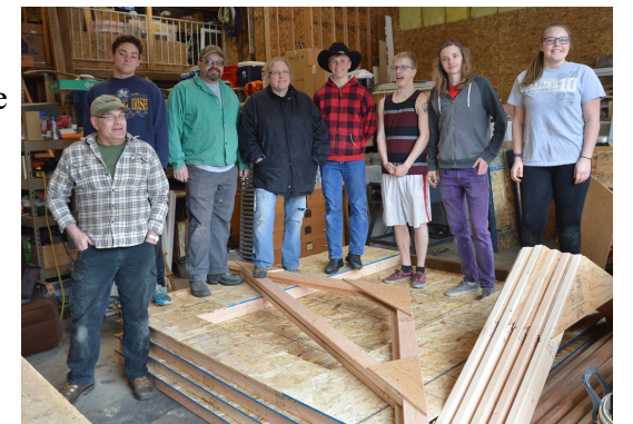
The scout build team with the completed roof and wall panels for the shed.