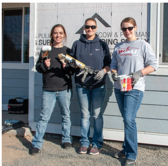
Thank you Fairfield Inn and Suites.