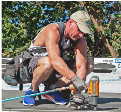
Lewiston Fire Fighters Local 1773 installing roof shingles