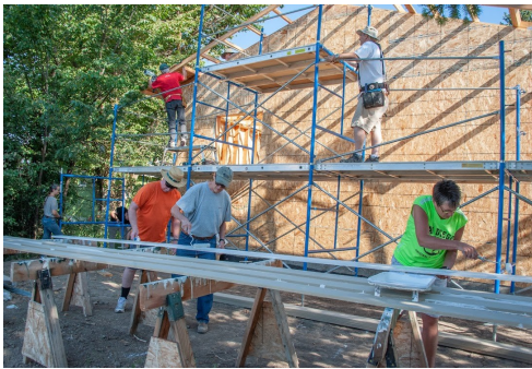
Pullman Lions Club and Codgers painting and installing sheathing.