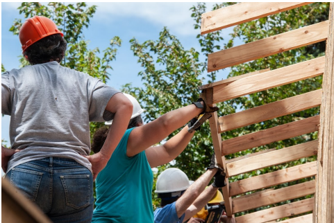
Diligent, Inc. volunteer team installing subfascia.