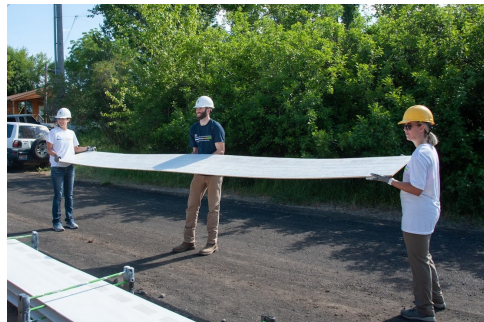
SEL, Inc volunteers stacking painted soffit to dry.