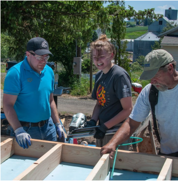
DKMullin Architects’ volunteers learning to frame walls.