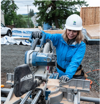
Alpine Vision volunteer cutting wall sections