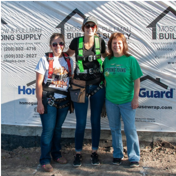
Umpqua Bank volunteers prepare to lay roofing paper.