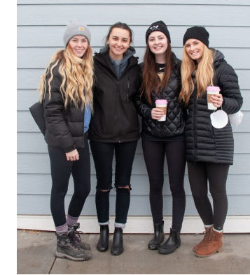
Thank you U of I Interior Design