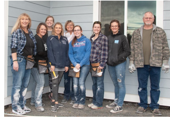
Thank you Cascadia of Aspen Park