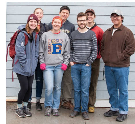
Thank you UI Humanitarian Engineering Corps.