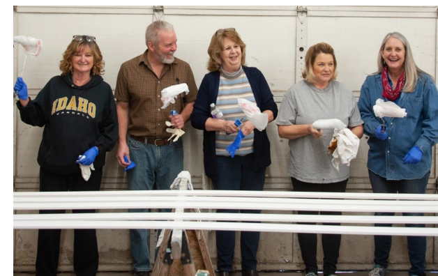
Thank you Latah County Board of REALTORS for sharing your painting skills!