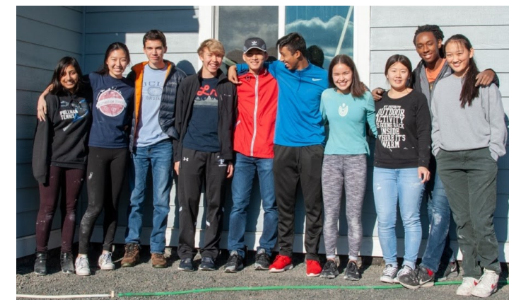
Thank you Pullman High School Key Club