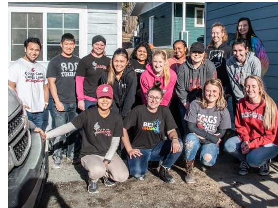
Thank you WSU CCE