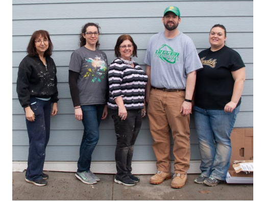
Thank you Potlatch Teachers Association