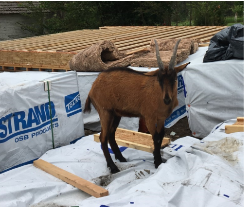
Everyone wants to help build the Kruger home!