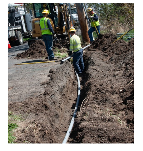
Avista lays utilities.