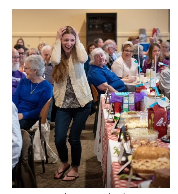
Dessert Dash Pressure: What dessert to choose?!? No worries— they are all delicious!