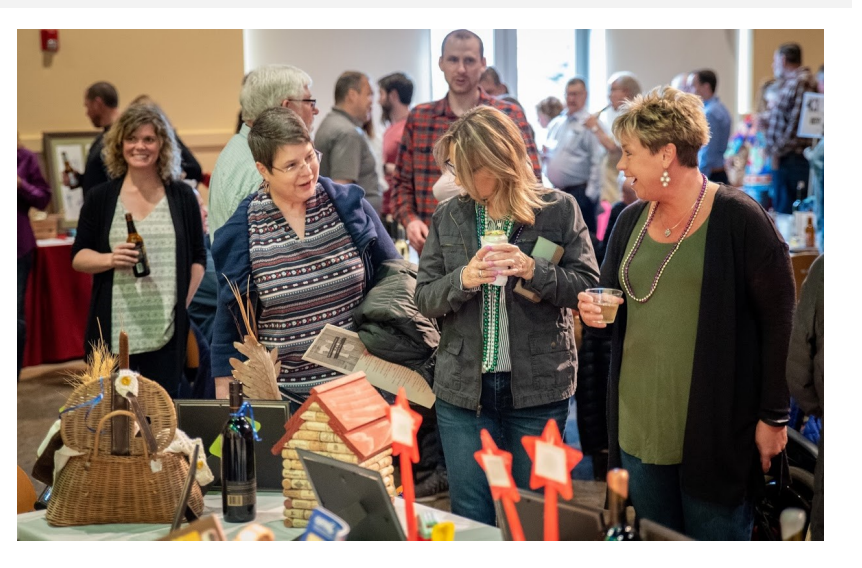
Guests checking out the silent auction items.