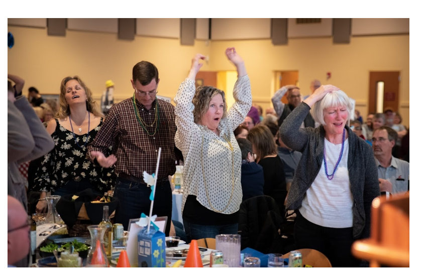
The triumph and heartbreak of the Heads 'n' Tails Game.