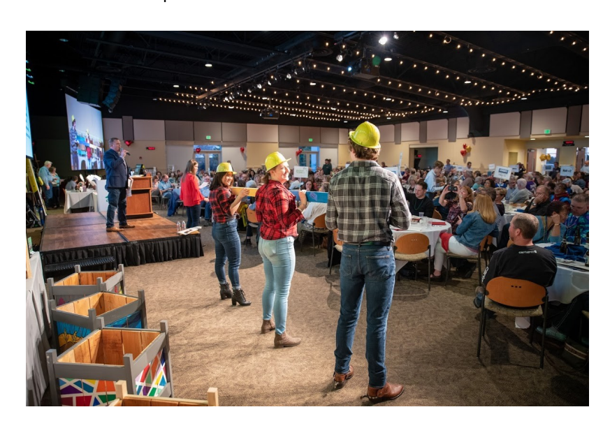
Volunteers display 2x4 studs decorated by Gar-Pal art students during the live auction. The studs raised $2500 to help build the Kruger Home.