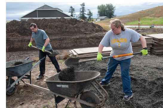
Fairfield Inn and Suites Moscow volunteers were heavy lifters, moving gravel to prepare the Uniontown site for the sidewalk.