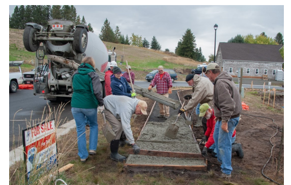
Wells Fargo volunteers and Codger Crew members poured the Uniontown sidewalk.