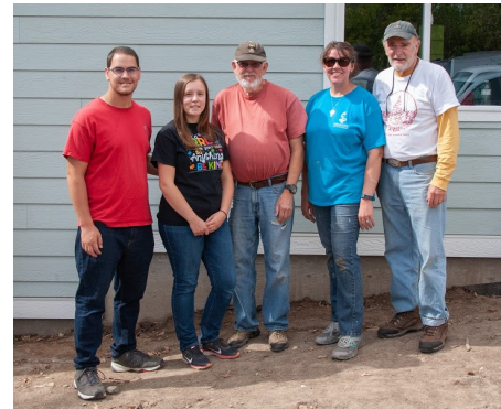
Local Methodist Church members turned out to lend a hand.