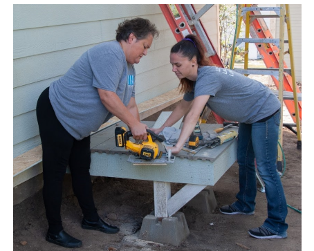
Aspen Park of Cascadia volunteers trim siding.