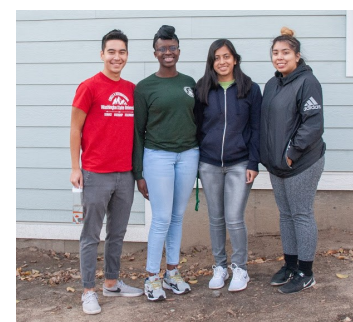
Circle K International volunteers at the Kruger home.