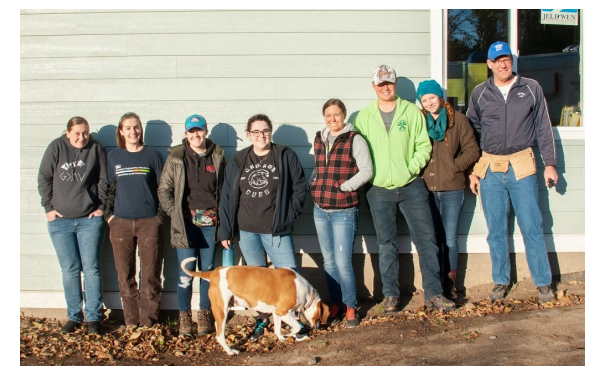
SEL volunteers (& friend) installed sheetrock inside the Kruger home.