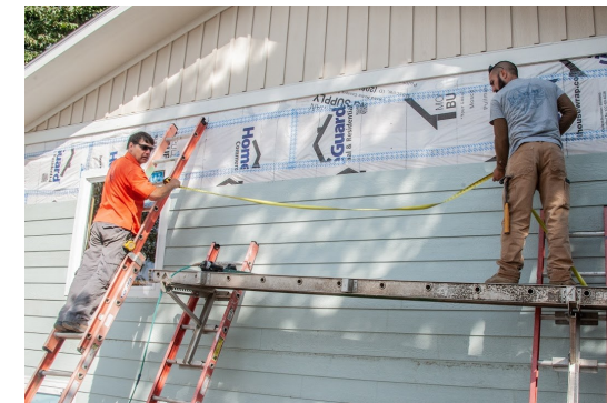
Volunteers from Plateau Archaeological Investigations hang siding at the Kruger home.