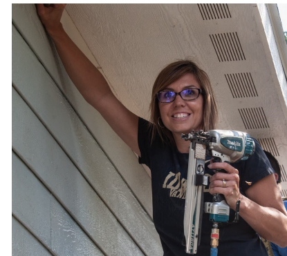
HomeBridge Financial volunteers helped finish exterior work.