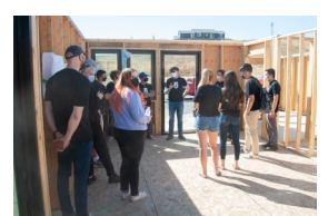
Wall Raising Celebration with WSU