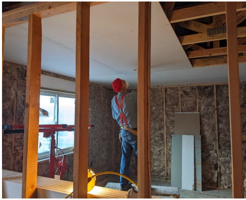
Indoor work on sheet rock