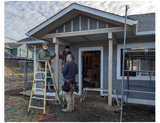
Exterior porch work