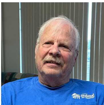
John Read Extra Mile Award