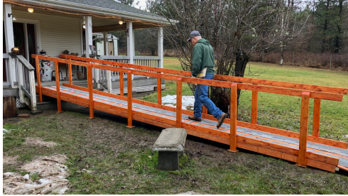
Recent ramp installation