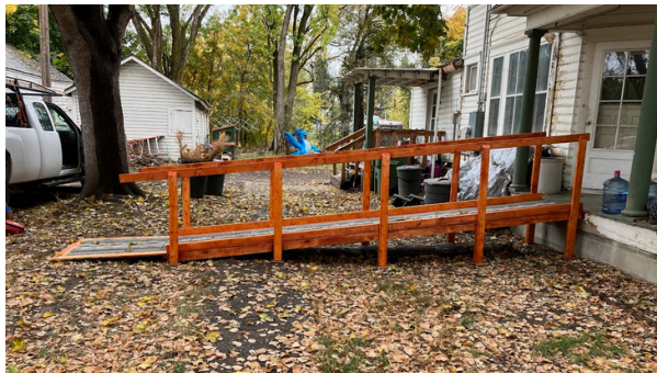
Recent ramp installation in Palouse, WA

Our Ramps & Rails volunteers have hit a new record this year! Our crew has completed 45 projects so far this year, and we receive requests for assistance weekly. If you know anyone in need of assistance please have them apply through our website, palousehabitat.org , or call our office directly at (208) 883-8502.